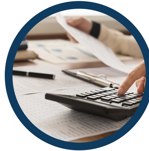
Finance & Insurance