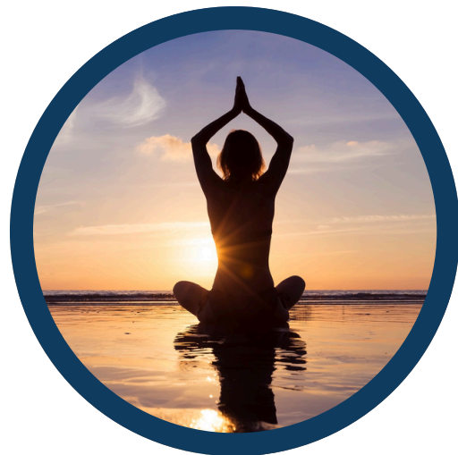
Health & Wellbeing