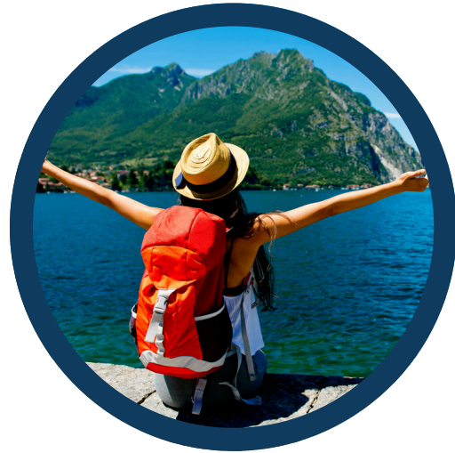
Travel & Accommodation