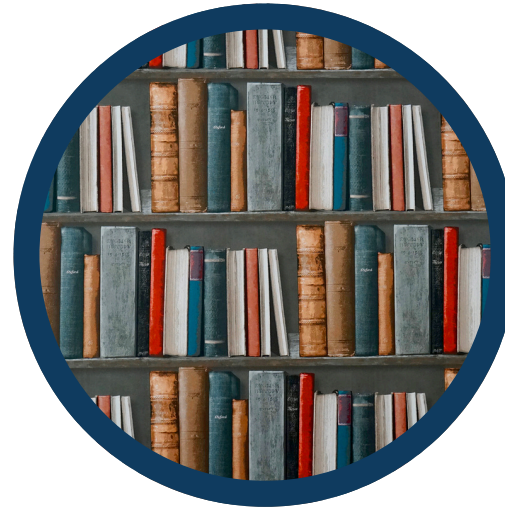
Education & Courses