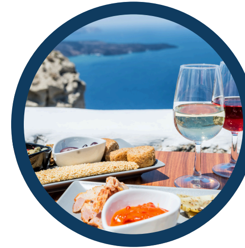
Food and Wine