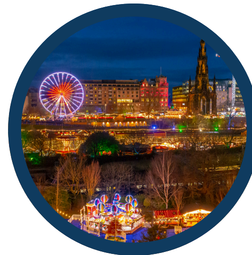
Tickets & Attractions